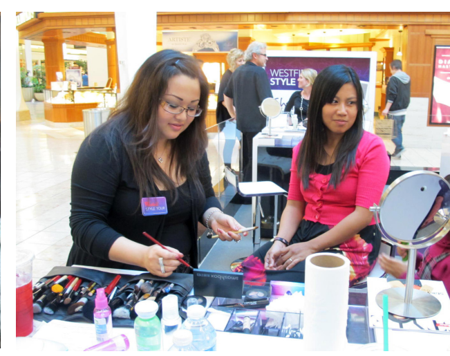
Contestant Winner Contestant Winner Beauty Makeovers