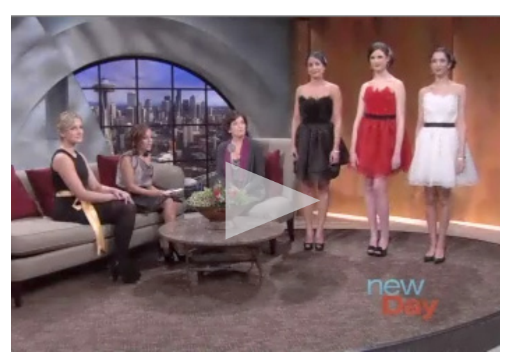
Click picture to watch tv spot.